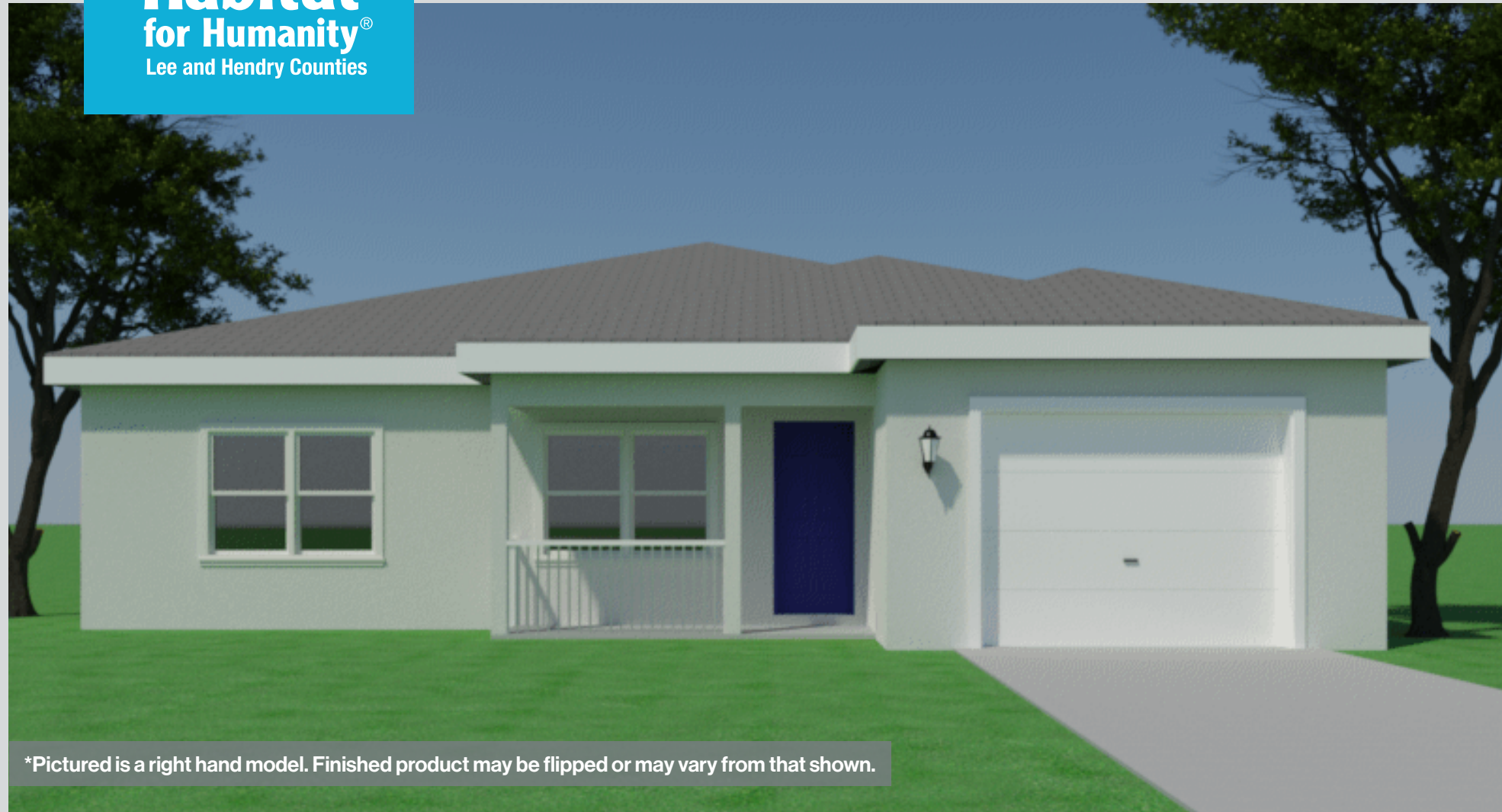
*Pictured is a right hand model. Finished product may be flipped or may vary from that shown.