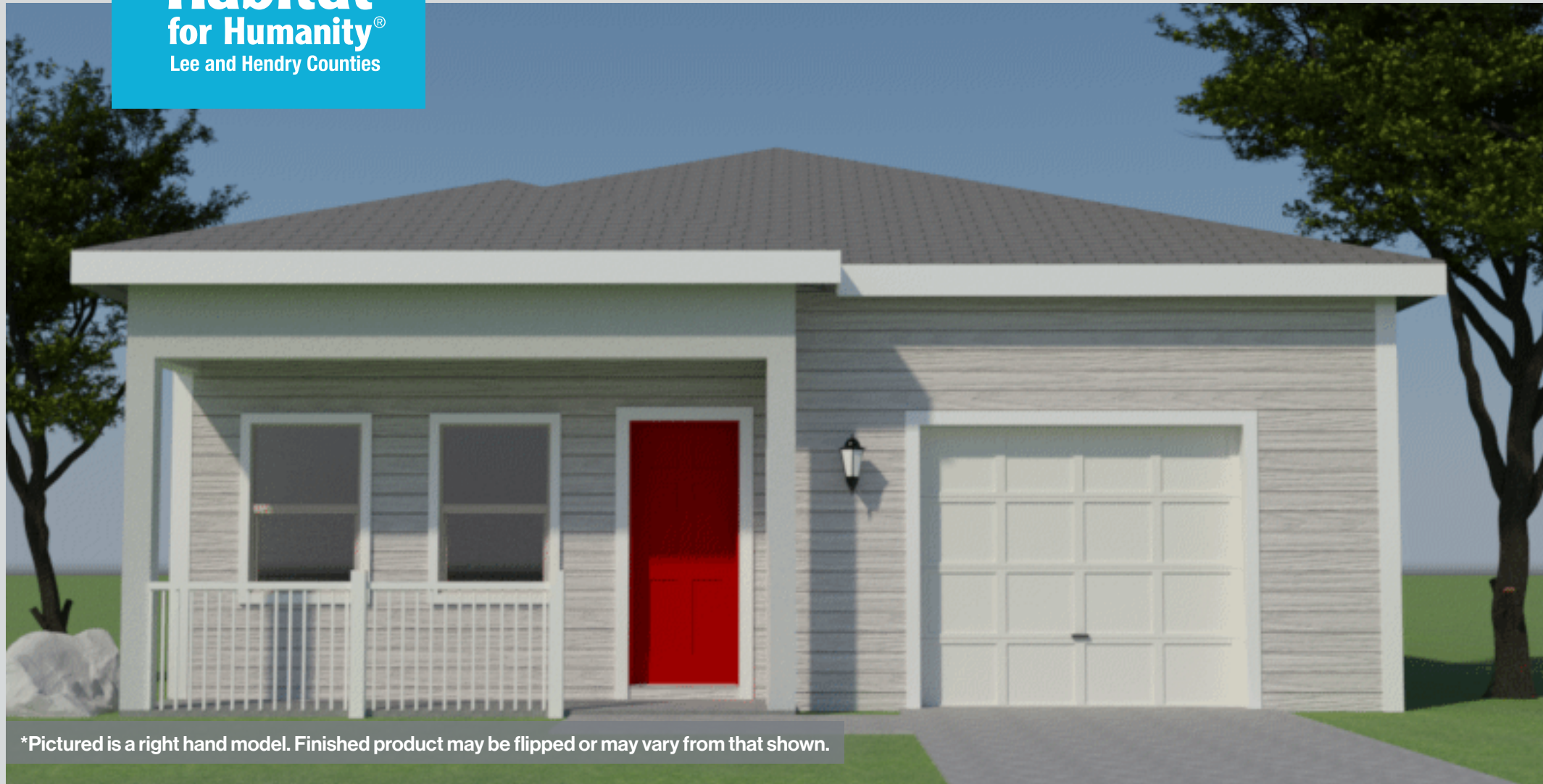
*Pictured is a right hand model. Finished product may be flipped or may vary from that shown.